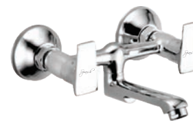
Wall Mixer Non-Telephonic