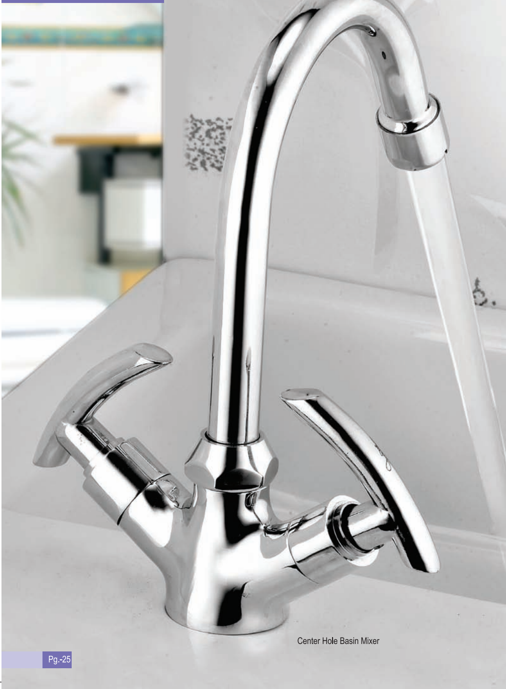
Center Hole Basin Mixer