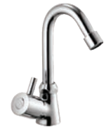
Pillar Cock Swan Neck