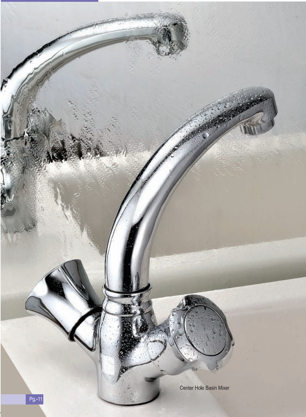
Center Hole Basin Mixer