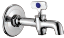
Taper Cock Extra Long