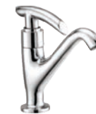
Pillar Cock High Neck