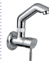
Sink Cock with Swivel Spout