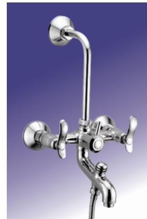
Wall Mixer 3-in-1 with provision for both hand and overhead shower