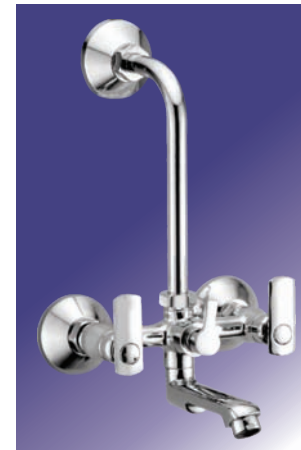
Wall Mixer 2-in-1 with 'L' Bend