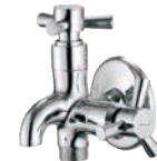
Bib Cock Two Way