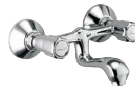
Wall Mixer Non-Telephonic