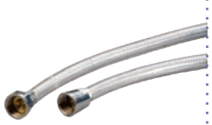
Full CP Classic