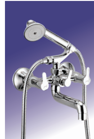
Wall Mixer 2-in-1 with 'L' Crutch