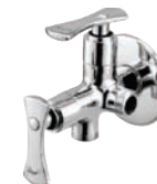
Angle Cock Two Way