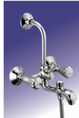
Wall Mixer 3-in-1 with provision for both hand and overhead shower