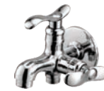
Bib Cock Two Way