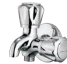
Bib Cock Two Way