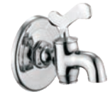
Taper Cock Short Fish