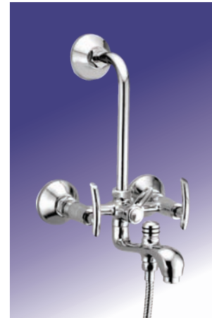
Wall Mixer 3-in-1 with provision for both hand and overhead shower