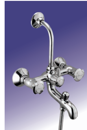
Wall Mixer 3-in-1 with provision for both hand and overhead shower