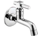
Bib Cock Long