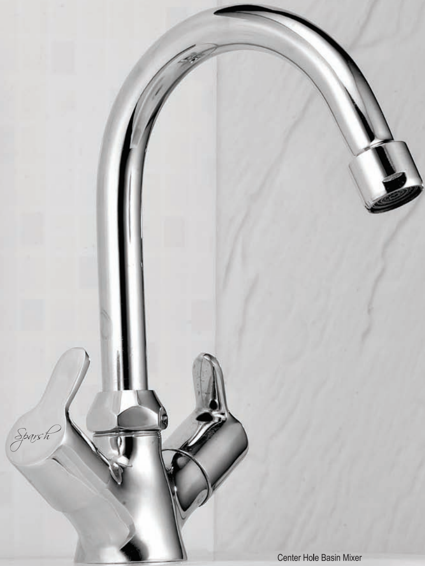
Center Hole Basin Mixer