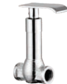
Concealed Stop Cock