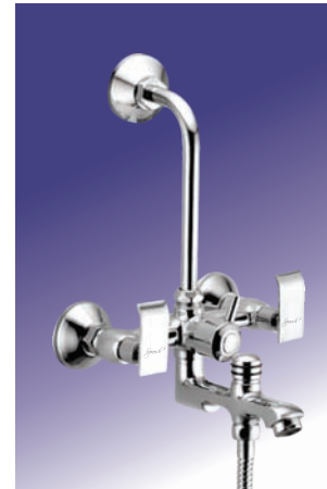
Wall Mixer 3-in-1 with provision for both hand and overhead shower