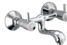
Wall Mixer Non-Telephonic