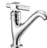
Pillar Cock High Neck