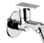
Nozzle Bib Cock