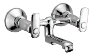
Wall Mixer Non-Telephonic