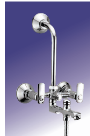
Wall Mixer 3-in-1 with provision for both hand and overhead shower