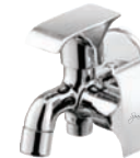
Bib Cock Two Way