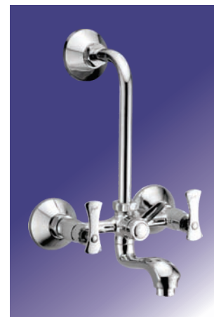
Wall Mixer 2-in-1 with 'L' Bend