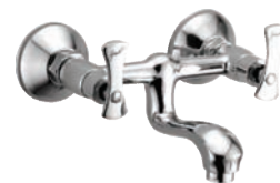
Wall Mixer Non-Telephonic