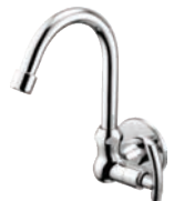
Sink Cock Swivel Spout