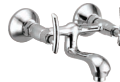
Wall Mixer Non-Telephonic