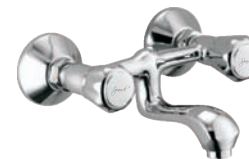
Wall Mixer Non-Telephonic