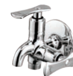
Bib Cock Two Way