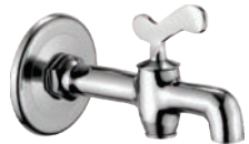
Taper Cock Extra Long Fish