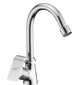
Pillar Cock Swan Neck