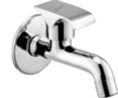
Bib Cock Long