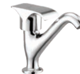
Pillar Cock High Neck