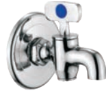
Taper Cock Short