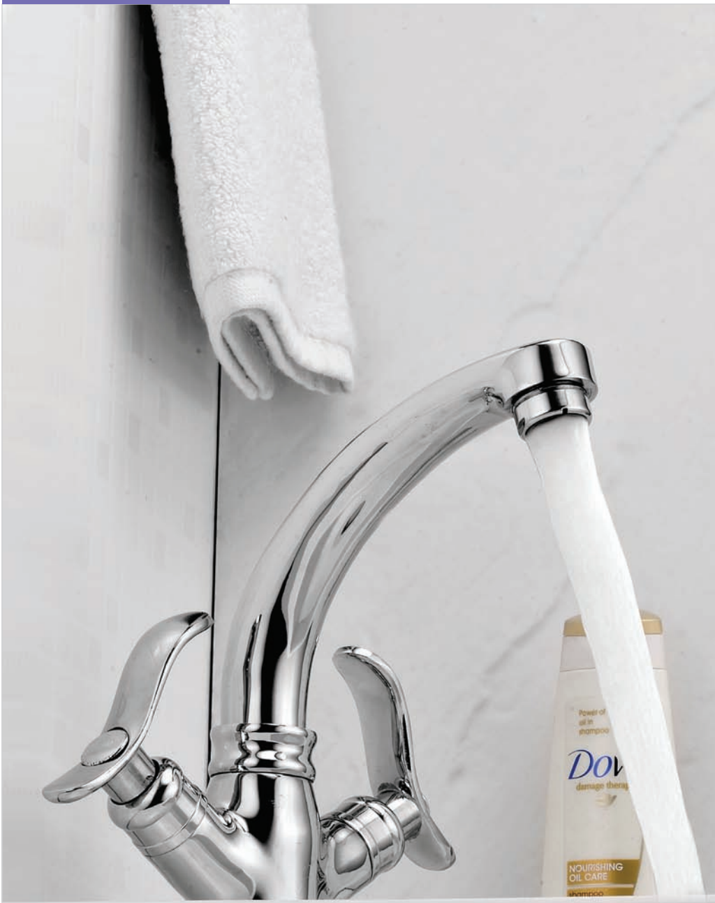
Center Hole Basin Mixer