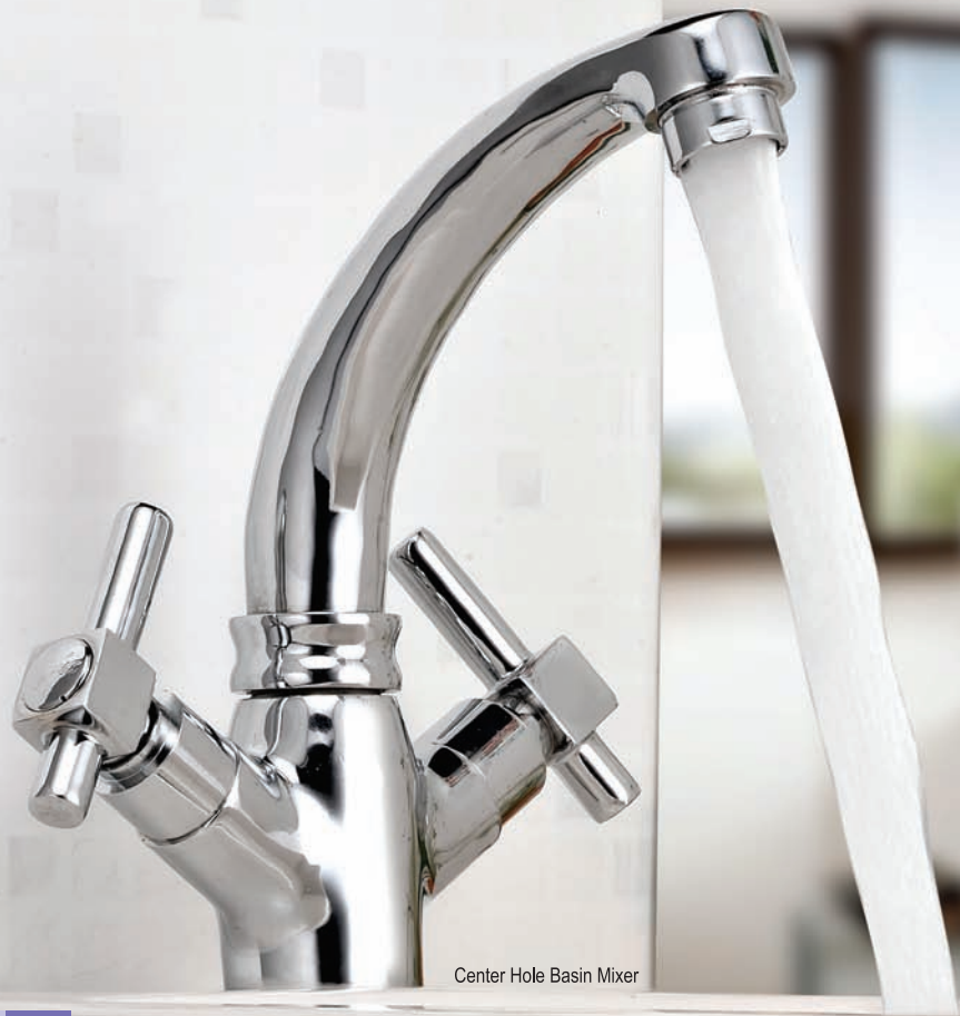
Center Hole Basin Mixer