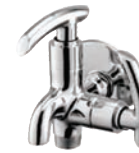
Bib Cock Two Way