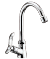
Pillar Cock Swan Neck