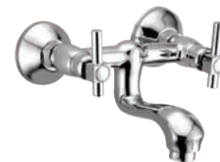
Wall Mixer Non-Telephonic