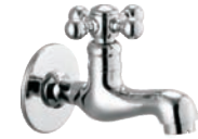
Bib Cock Long