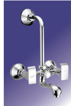
Wall Mixer 2-in-1 with 'L' Bend