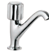
Pillar Cock High Neck