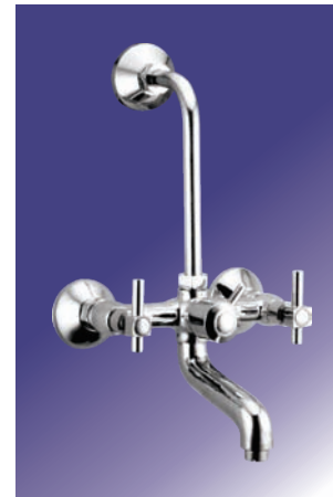
Wall Mixer 2-in-1 with 'L' Bend