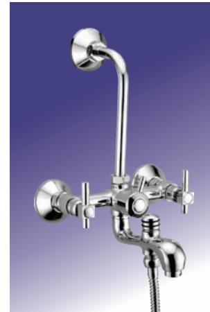
Wall Mixer 3-in-1 with provision for both hand and overhead shower