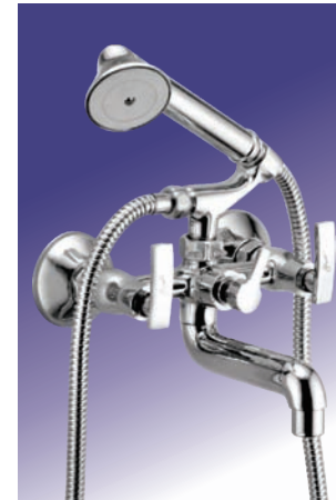
Wall Mixer 2-in-1 with Crutch