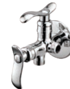
Angle Cock Two Way