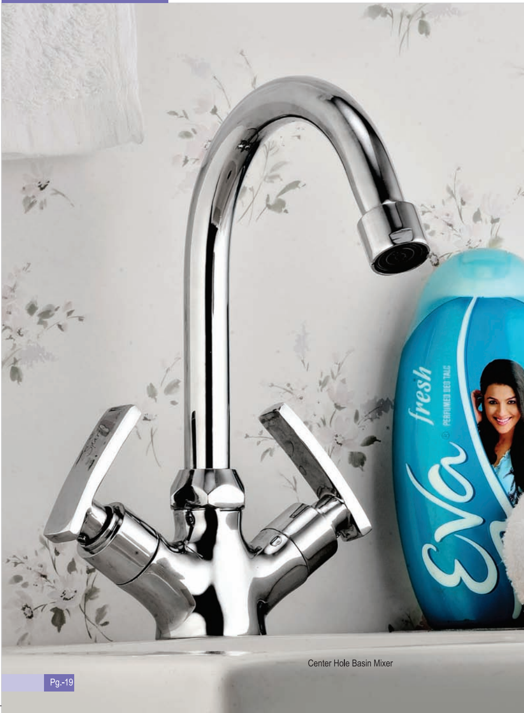
Center Hole Basin Mixer