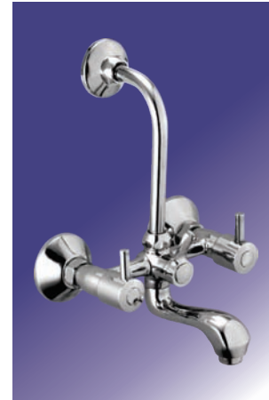
Wall Mixer 2-in-1 with 'L' Bend