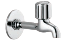
Bib Cock Long