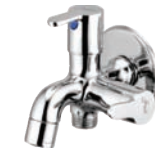
Bib Cock Two Way