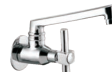
Sink Cock Swivel Spout