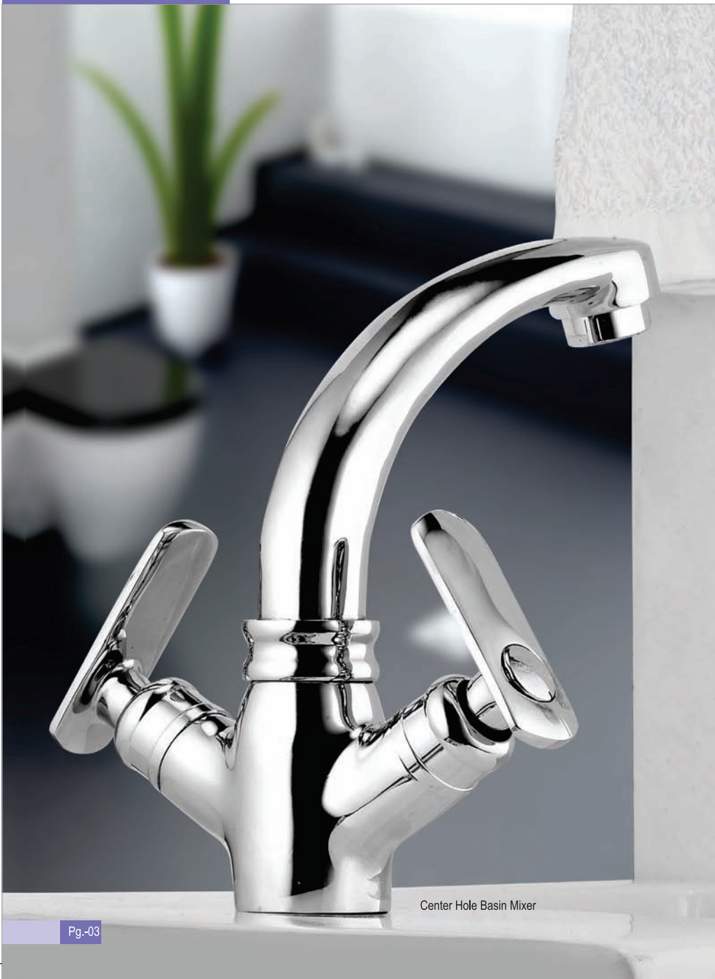
Center Hole Basin Mixer