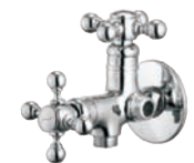
Angle Cock Two Way