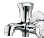
Bib Cock Two Way