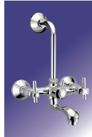
Wall Mixer 2-in-1 with 'L' Bend