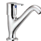
Pillar Cock High Neck