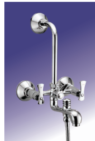
Wall Mixer 3-in-1 with provision for both hand and overhead shower