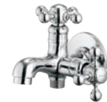
Bib Cock Two Way