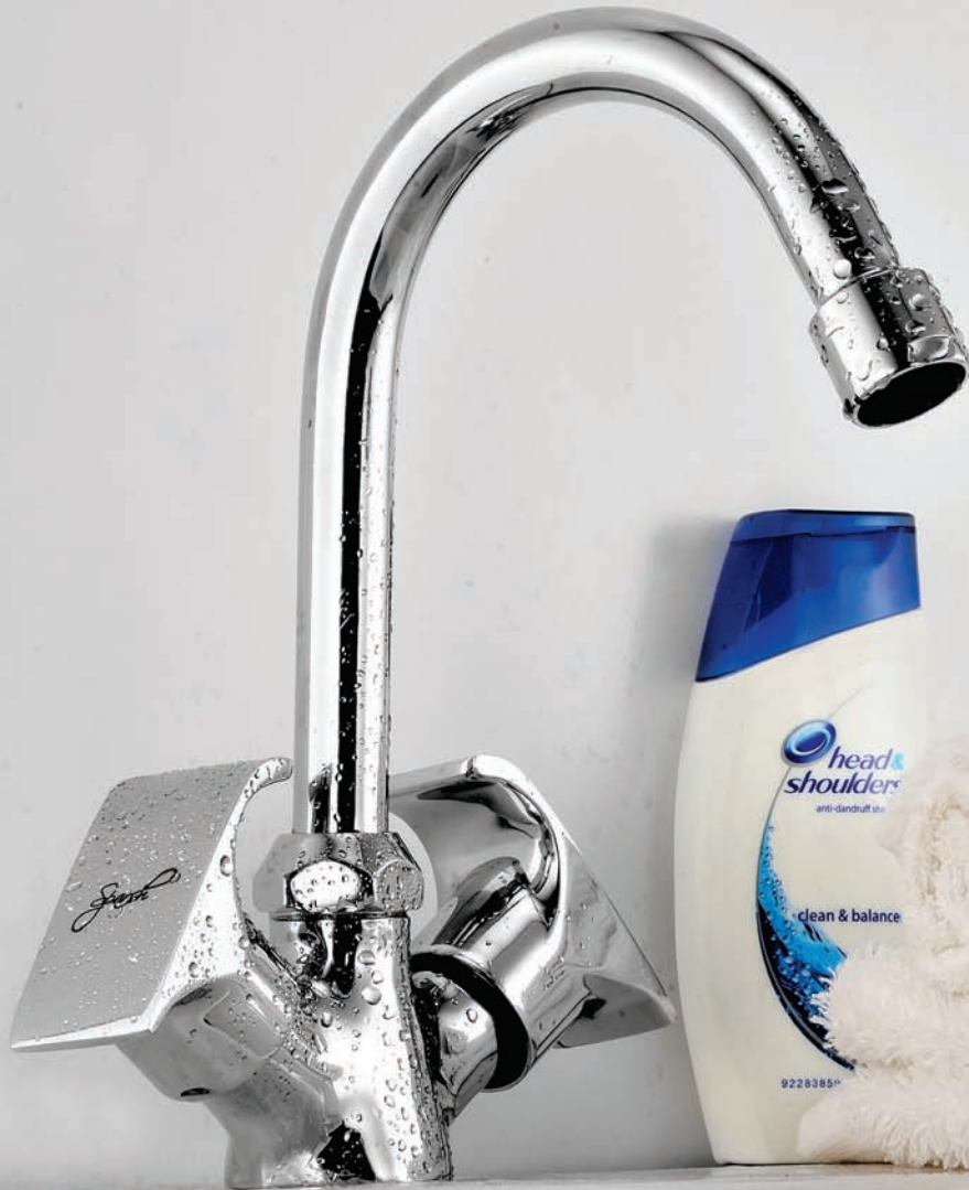
Center Hole Basin Mixer