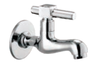
Bib Cock Long