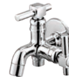
Bib Cock Two Way