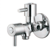
Angle Cock Two Way