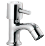
Pillar Cock Foam Flow