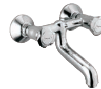
Wall Mixer Non-Telephonic