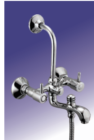
Wall Mixer 3-in-1 with provision for both hand and overhead shower