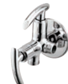
Angle Cock Two Way