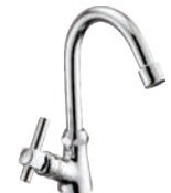
Pillar Cock Swan Neck