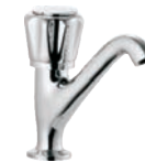
Pillar Cock High Neck