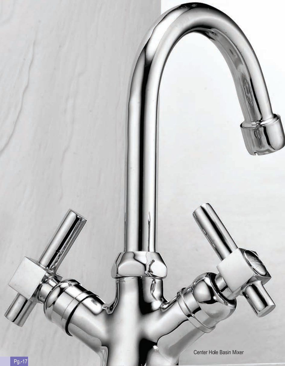
Center Hole Basin Mixer