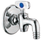
Taper Cock Nozzle