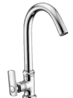
Pillar Cock Swan Neck