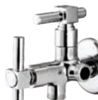
Angle Cock Two Way