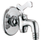
Taper Cock Nozzle Fish