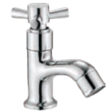
Pillar Cock Foam Flow