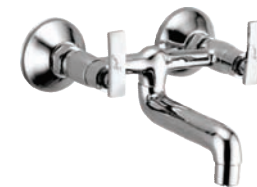
Wall Mixer Non-Telephonic