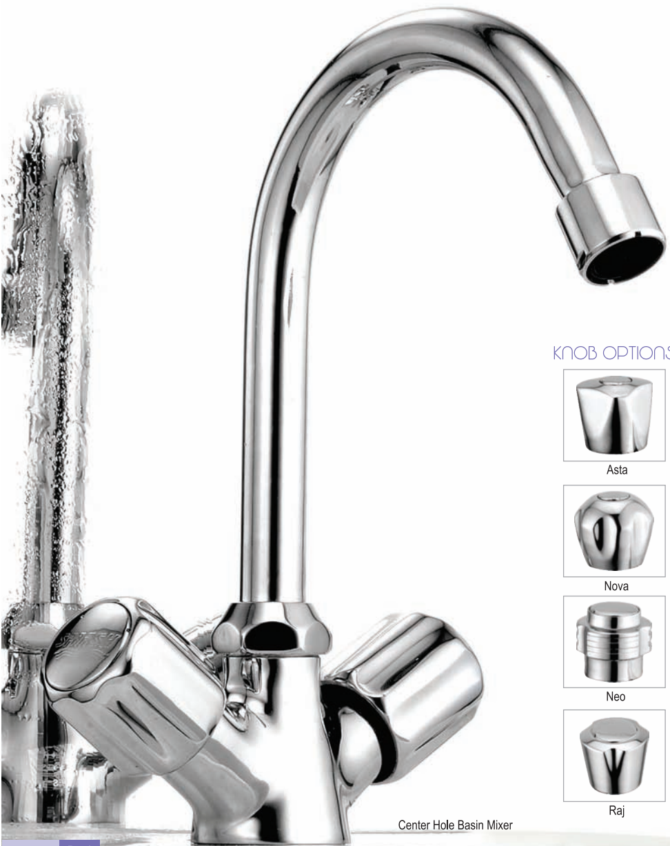
Center Hole Basin Mixer