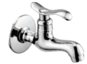
Bib Cock Long