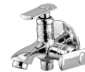
Bib Cock Two Way