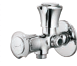
Angle Cock Two Way