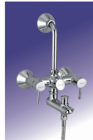
Wall Mixer 3-in-1 with provision for both hand and overhead shower