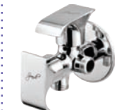
Angle Cock Two Way