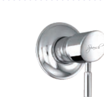
Concealed Stop Cock