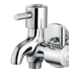
Bib Cock Two Way