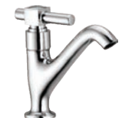
Pillar Cock High Neck