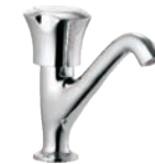
Pillar Cock High Neck