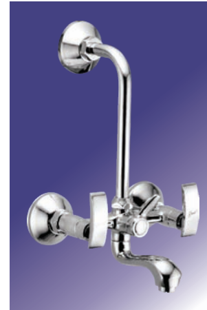
Wall Mixer 2-in-1 with 'L' Bend