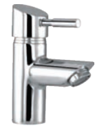
Single Lever Basin Mixer