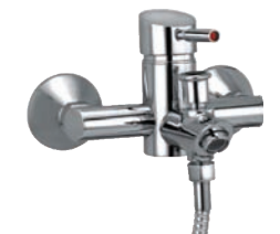
Single Lever Wall Mixer 3-in-1 with provision for both hand and overhead shower