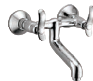
Wall Mixer Non-Telephonic