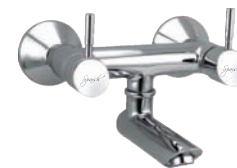
Wall Mixer Non-Telephonic