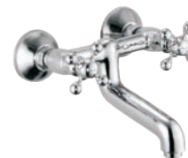
Wall Mixer Non-Telephonic