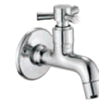
Bib Cock Foam Flow