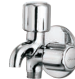
Bib Cock Two Way