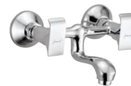
Wall Mixer Non-Telephonic