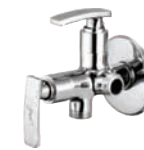
Angle Cock Two Way