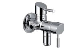
Bib Cock Two Way