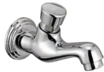
Bib Cock Short Body