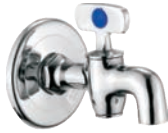
Taper Cock Medium