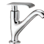
Pillar Cock High Neck