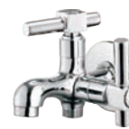
Bib Cock Two Way