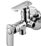
Angle Cock Two Way