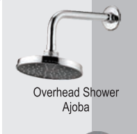
Overhead Shower Ajoba