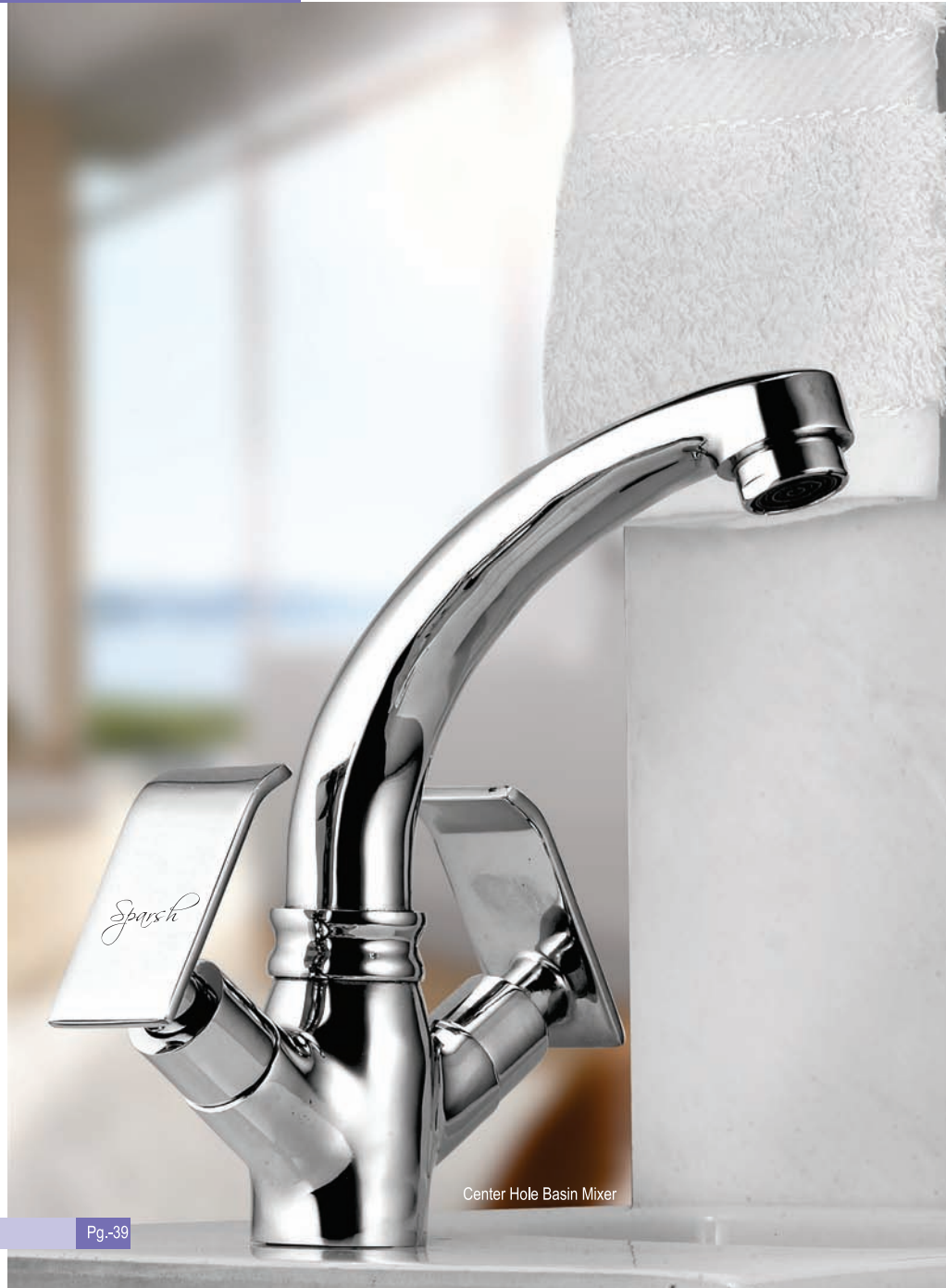
Center Hole Basin Mixer