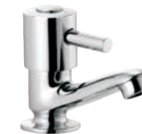
Pillar Cock (Designer)