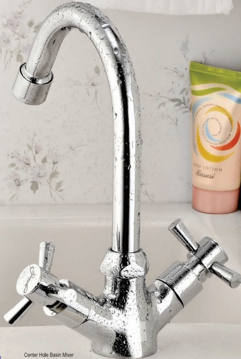
Center Hole Basin Mixer