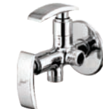
Angle Cock Two Way