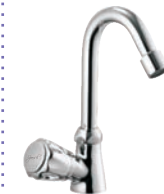
Pillar Cock Swan Neck