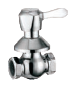
Flush Cock Kennedy