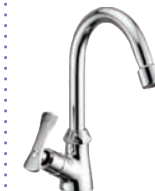
Pillar Cock Swan Neck