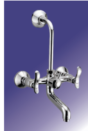
Wall Mixer 2-in-1 with 'L' Bend