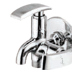
Bib Cock Two Way