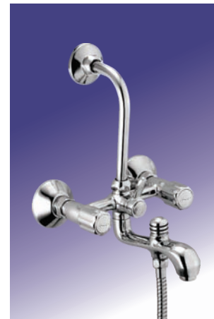
Wall Mixer 3-in-1 with provision for both hand and overhead shower