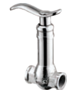
Concealed Stop Cock