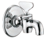
Taper Cock Locking