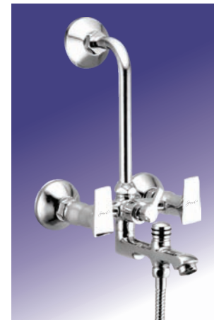
Wall Mixer 3-in-1 with provision for both hand and overhead shower