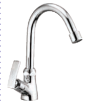
Pillar Cock Swan Neck