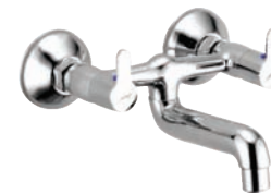
Wall Mixer Non-Telephonic