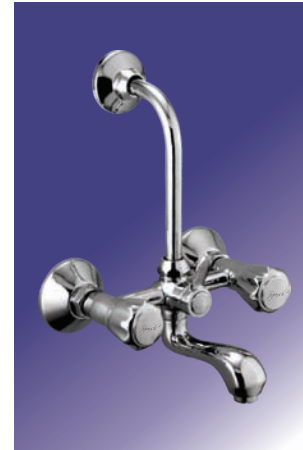
Wall Mixer 2-in-1 with 'L' Bend