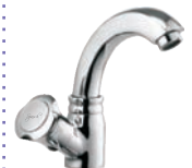
Pillar Cock Swan Neck