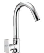
Pillar Cock Swan Neck