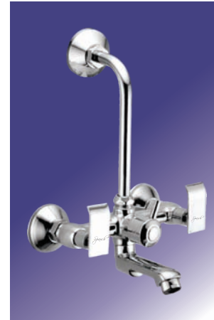
Wall Mixer 2-in-1 with 'L' Bend