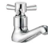
Pillar Cock (Round)