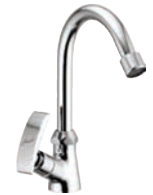
Pillar Cock Swan Neck