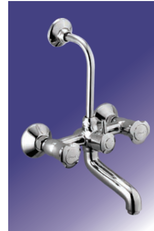
Wall Mixer 2-in-1 with 'L' Bend