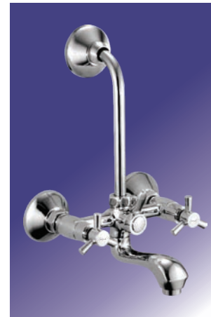
Wall Mixer 2-in-1 with 'L' Bend