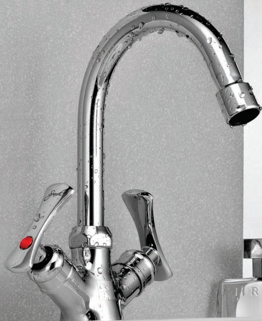
Center Hole Basin Mixer