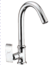
Pillar Cock Swan Neck