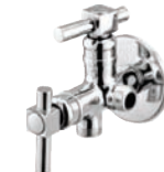
Angle Cock Two Way