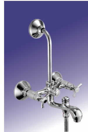
Wall Mixer 3-in-1 with provision for both hand and overhead shower