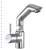
Pillar Cock Swan Neck