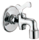
Taper Cock Foam Flow Fish