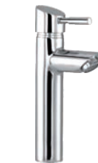
Pillar Cock Tall Boy