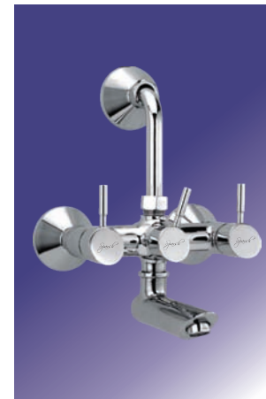
Wall Mixer 2-in-1 with 'L' Bend