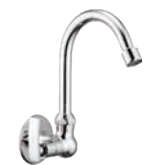
Sink Cock Swivel Spout