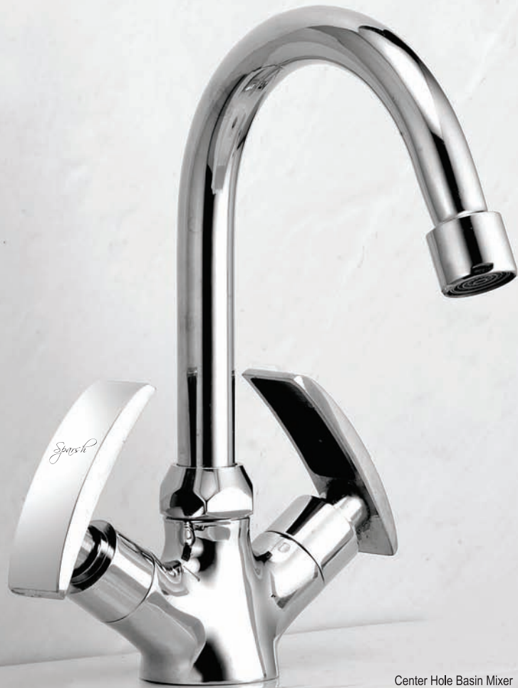
Center Hole Basin Mixer