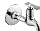
Bib Cock Long