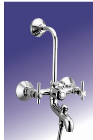
Wall Mixer 3-in-1 with provision for both hand and overhead shower