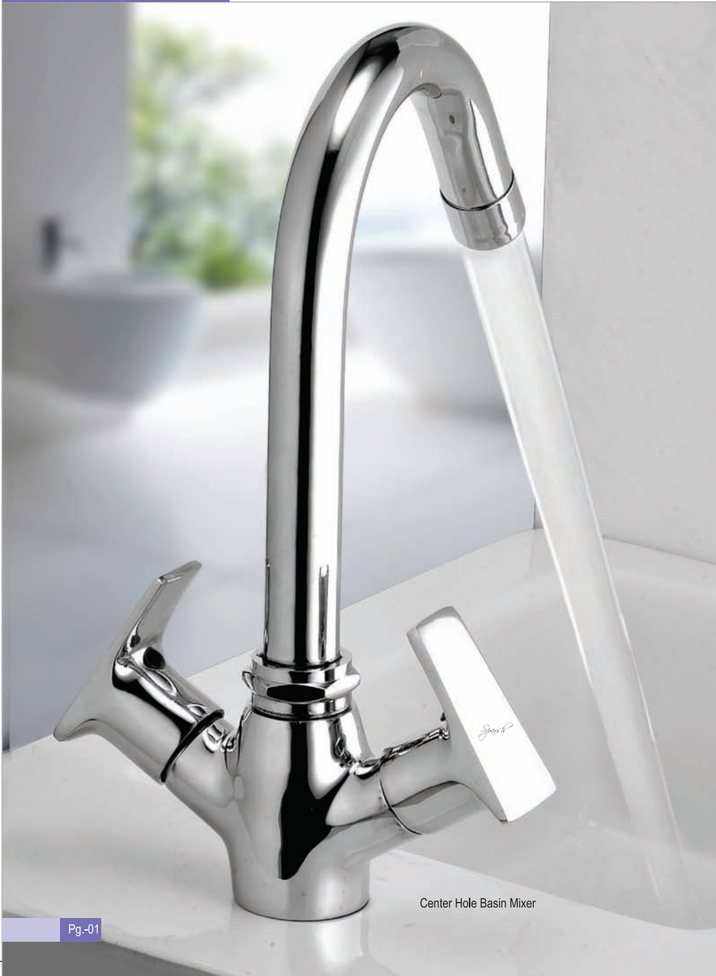
Center Hole Basin Mixer