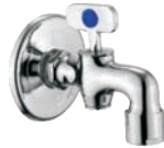
Taper Cock Foam Flow