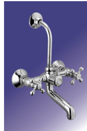
Wall Mixer 2-in-1 with 'L' Bend