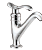
Pillar Cock High Neck