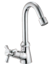
Pillar Cock Swan Neck