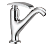
Pillar Cock High Neck