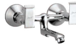
Wall Mixer Non-Telephonic