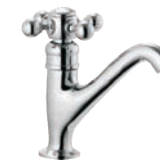
Pillar Cock High Neck