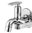
Bib Cock Two Way