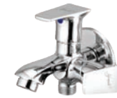
Bib Cock Two Way