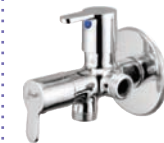
Angle Cock Two Way