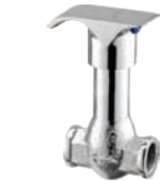
Concealed Stop Cock