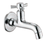
Bib Cock Long Foam Flow