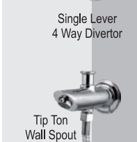
Tip Ton Wall Spout