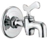
Taper Cock Medium Fish