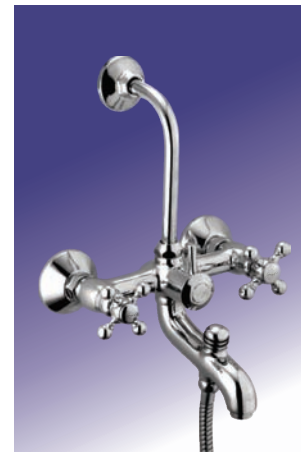
Wall Mixer 3-in-1 with provision for both hand and overhead shower