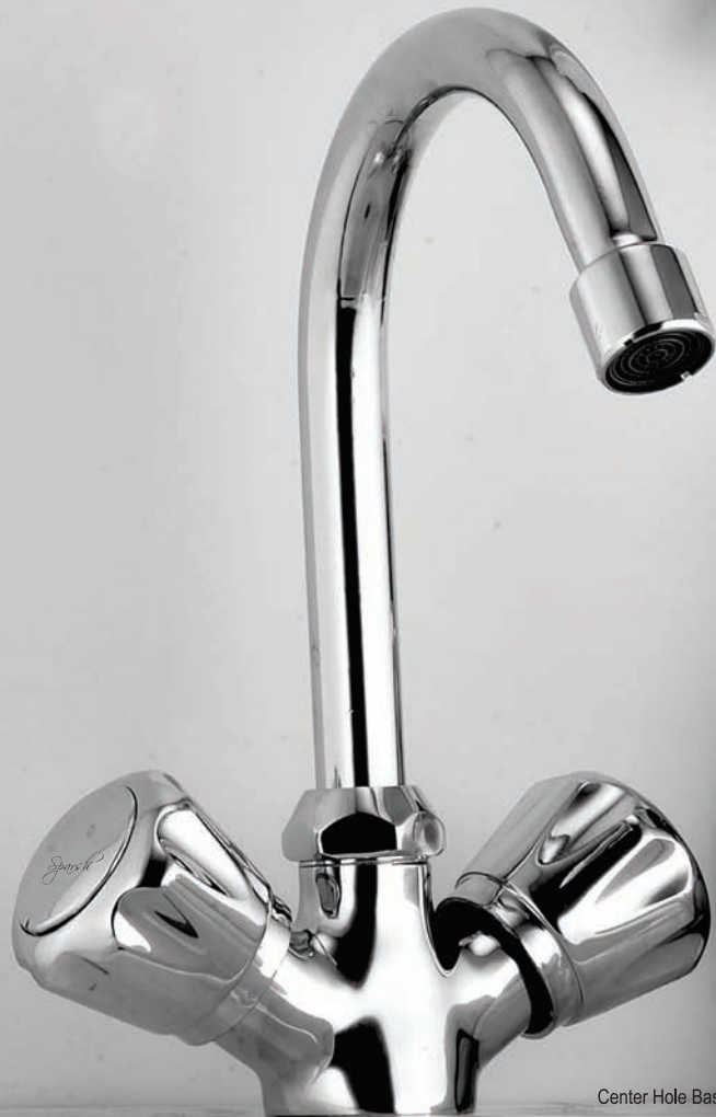
Center Hole Basin Mixer