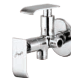
Angle Cock Two Way