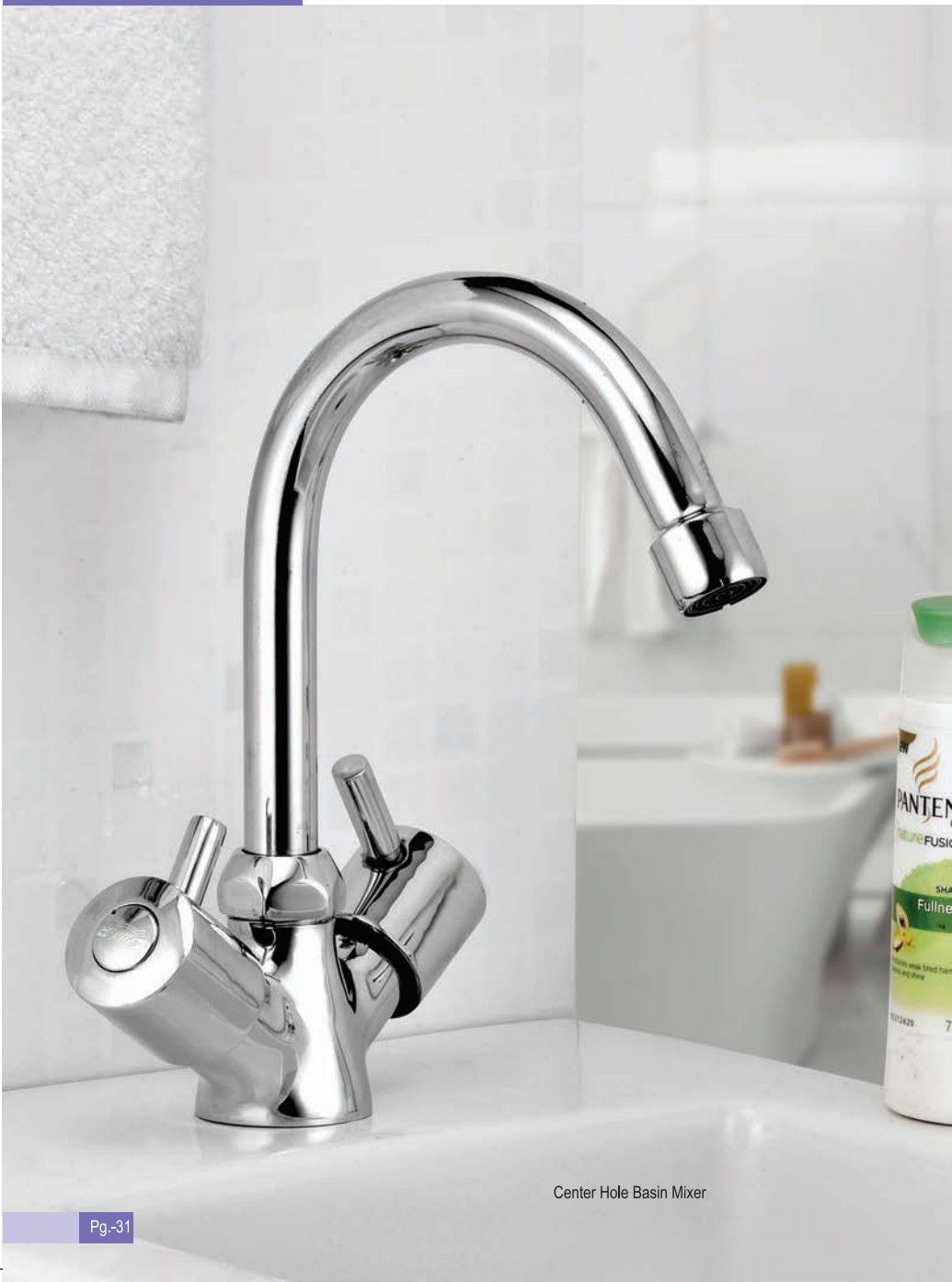
Center Hole Basin Mixer